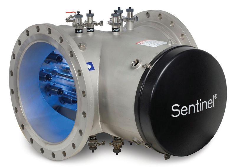
Capital Controls SN24 Sentinel UV Reactor